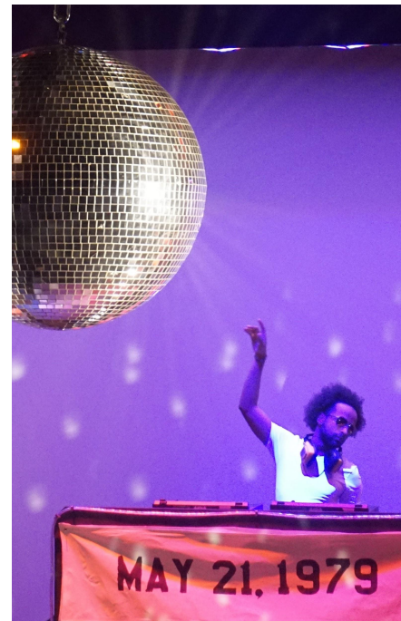
Trocadero Rose workshop

University of Iowa, M.F.A. Playwriting, 2018 (anticipated) University of Iowa, B.G.S. Performance, Art, and Cultural Studies, 1990 University of Hull (UK), 1987