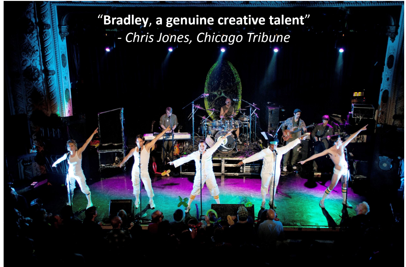
Alien Queen, Metro Chicago